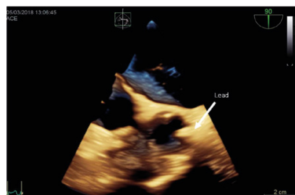
Figure 2. (A) Initial lead placement in the SVC

After opening of the device pocket and dissecting the leads from adhering tissue, this technique allows the assessment of lead movement during the procedure. It is crucial to visualize the SVC at the most superior level possible, preferably including its initial segment where both brachiocephalic veins merge. If it is possible to see on the screen lead movement inside the SVC while the operator pulls on it, then it can be determined that it is safe to proceed with laser TLE (see Figure 2 A & B).