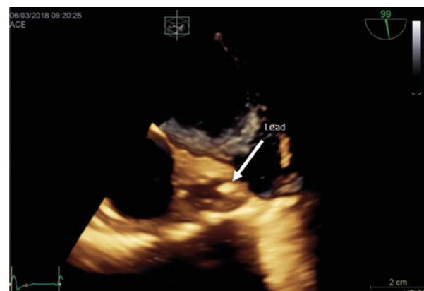
Figure 2. (B) Change of lead placement after pulling on it